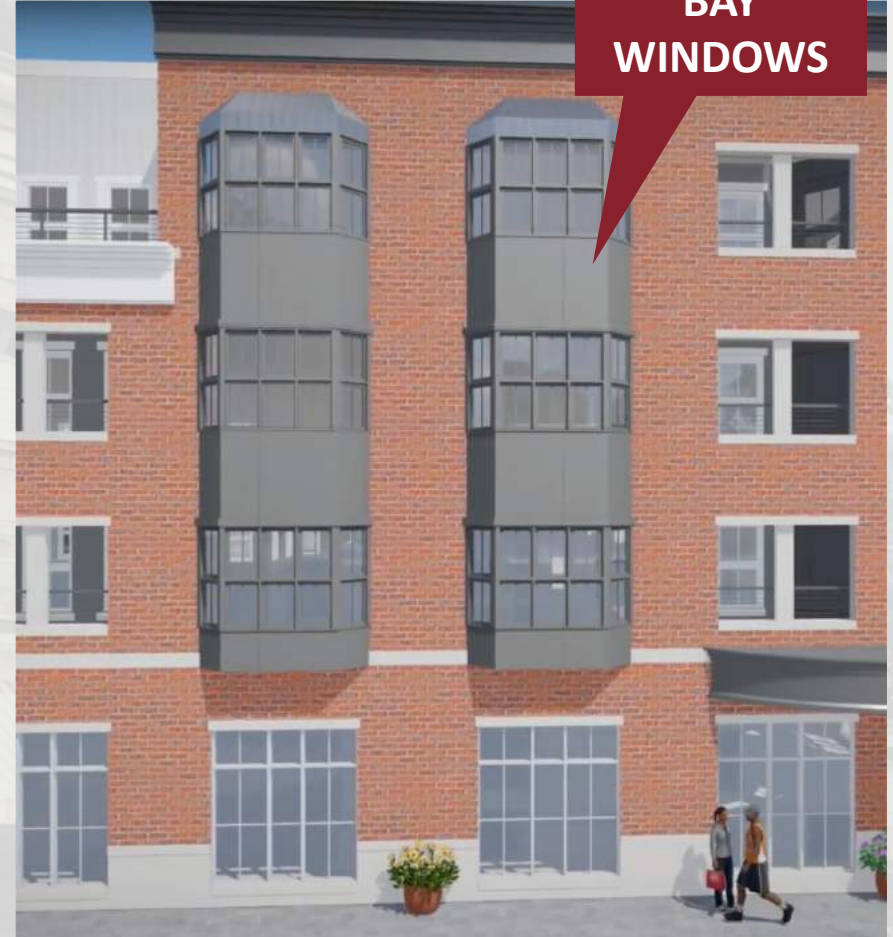
308 Wall St. Double-bay windows